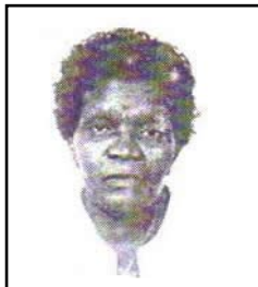
Hon. Geradine Namirembe Bitamazire (MP)