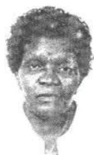
Hon. Geradine Namirembe Bitamazire (MP)

The failure of learners to attain acceptable levels of proficiency in reading and writing at Primary Three (P3) level is considered to be a barrier to their full enjoyment of their right to education as enshrined in Section 30 of the Constitution of the Republic of Uganda (1995). Sector-wide reflection on this phenomenon has led to identification of challenges which need urgent attention to make schooling more beneficial to the learners. The Ministry commissioned a study which carried out a Situational Analysis which showed that one of the factors causing poor performance in literacy, numeracy and life skills were the structures of the Primary School Curriculum.